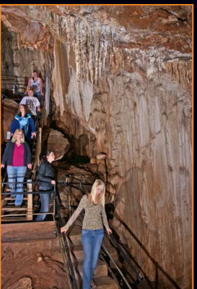
Descending into the caverns reveals rare and unique underground treasures.