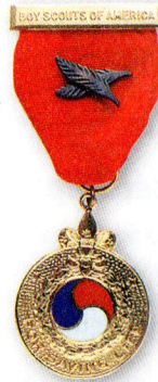
Honor Medal With Crossed Palms

The Honor Medal with Crossed Palms may be awarded in exceptional cases to a youth member or adult leader who has demonstrated unusual heroism and extraordinary skill or resourcefulness in saving or attempting to save a life at extreme risk to self.