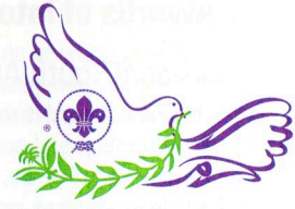
Messengers of Peace

Messengers of Peace is a World Scout Committee initiative designed to promote and recognize service projects that contribute to world peace. The goal of Messengers of Peace is to inspire millions of young men and women throughout the world to work closer toward achieving peace. Using state-of-the-art social media, the initiative lets Scouts from around the world share what they have done and inspire fellow Scouts to undertake similar efforts in their own communities. The result is a mosaic of stories, data, and outcomes showing the impact of the Scouting movement—a tool for recruiting members, assuring parents, inspiring donors, and making existing members proud to be Scouts.