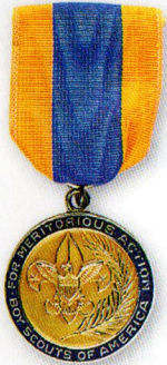
Medal of Merit